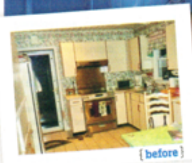
{ before }

before A low ceiling, fussy wallpaper, and not enough prep space made the dated kitchen feel cramped.